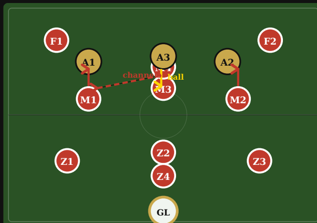
BOLA = posicao · closes/channels = F1 · shifts = linha de medios · linha de 4 fixa behind